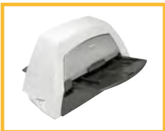
Kodak i1400 Series Scanners