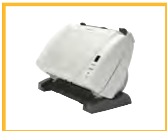
Kodak i1300 Series Scanners