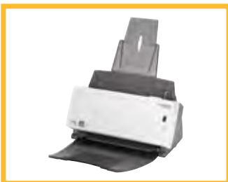
Kodak ScanMate i1120 Scanner

Find out more about Kodak i1200, i1300 and i1400 Series Scanners—plus the remarkably compact Kodak ScanMate i1120 Scanner (an ideal choice for offices new to scanning)—today. They all feature the Smart Touch functionality and all the advantages that come with it!