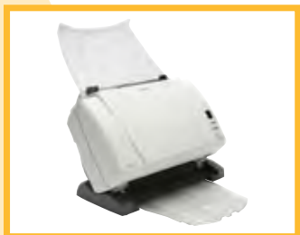
Kodak i1200 Series Scanners

Smart Touch functionality is built into all of these Kodak Scanners—